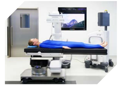
The carbon extension EXTCARB provides imaging clearance of 1280mm (from the head to the femoral artery or from the feet to the sternum).